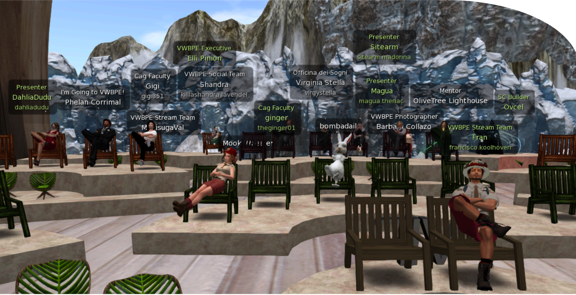
The symposium organised by Çağ University and VWEC and held in virtual worlds was successfully completed.