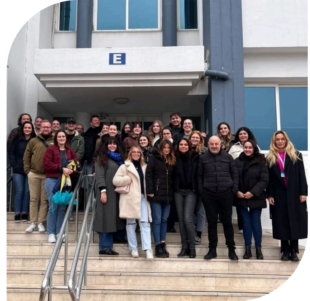
Hochschule für öffentliche Verwaltung Kehl University visited our campus.