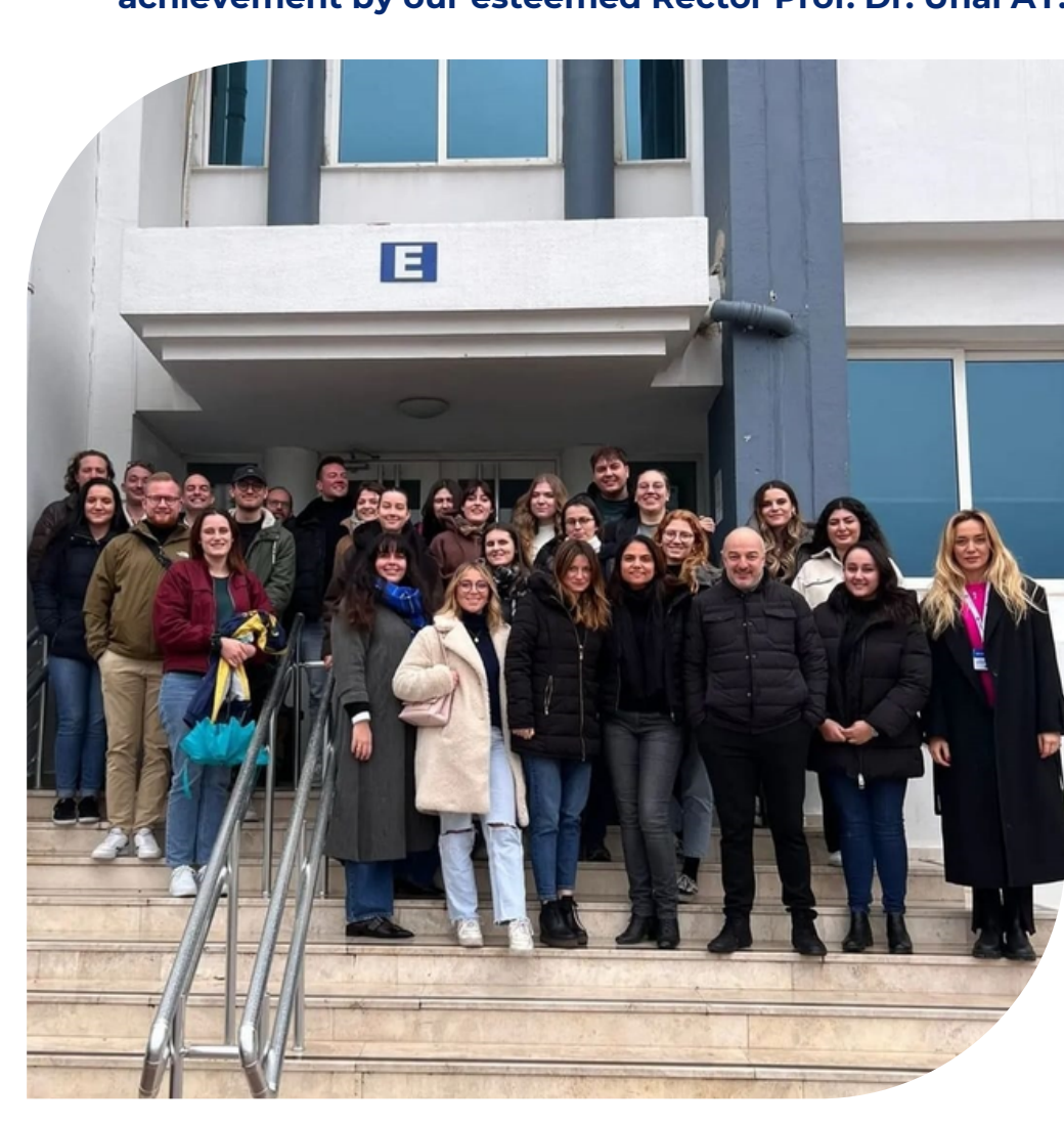
Hochschule für öffentliche Verwaltung Kehl University