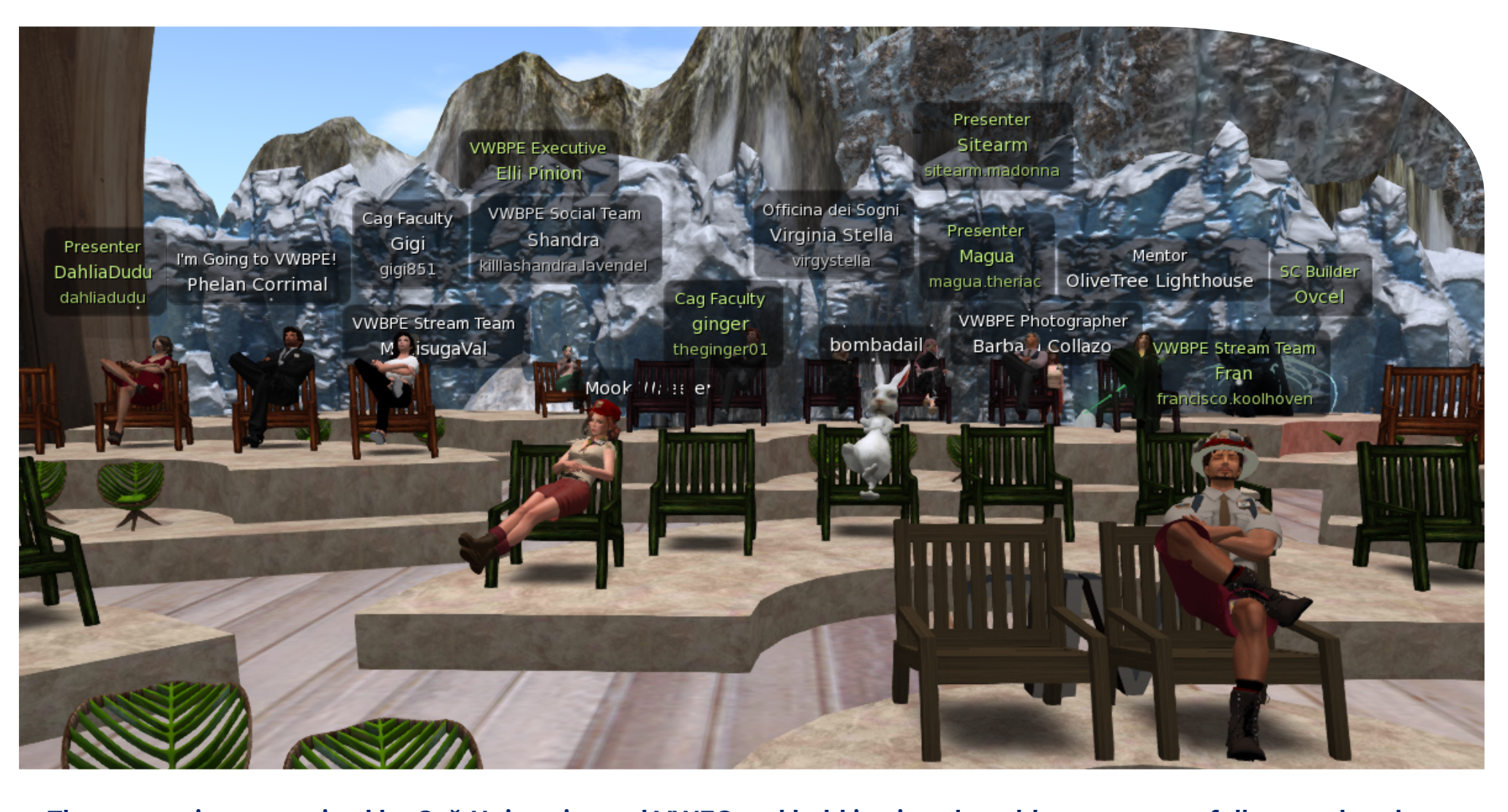
The symposium organised by Çağ University and VWEC and held in virtual worlds was successfully completed.